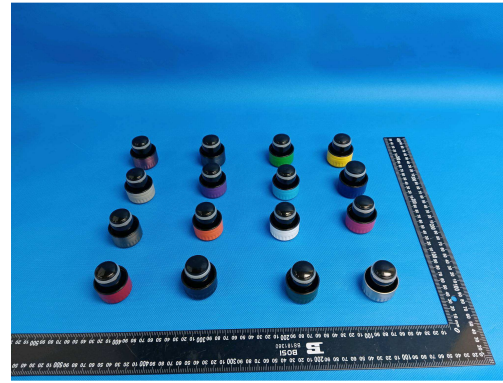
Sample Not Tested (Photo provided by client)