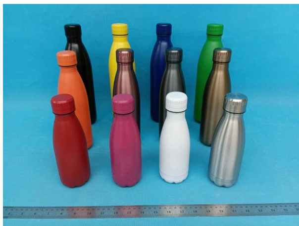
Sample Not Tested